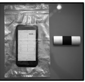
Carefully disinfect all equipment using product with known activity against SARS-CoV-2.