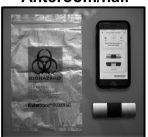
Place smartphone in biohazard bag. Nurse/provider in PPE helps patient record mobile ECG.*